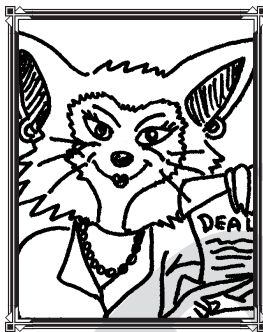
Felicia the Fox