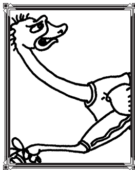
Oliver the Ostrich