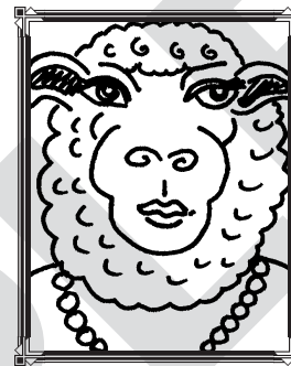
Shirley the Sheep