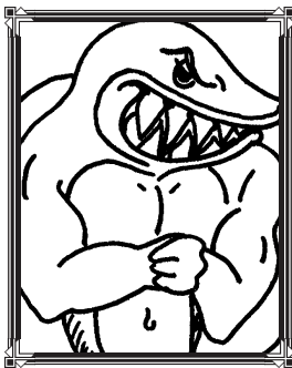
Sammy the Shark

Your job: Develop the personality of each character. How do these animals usually act? What might they say to each other? How will they handle the conflict?